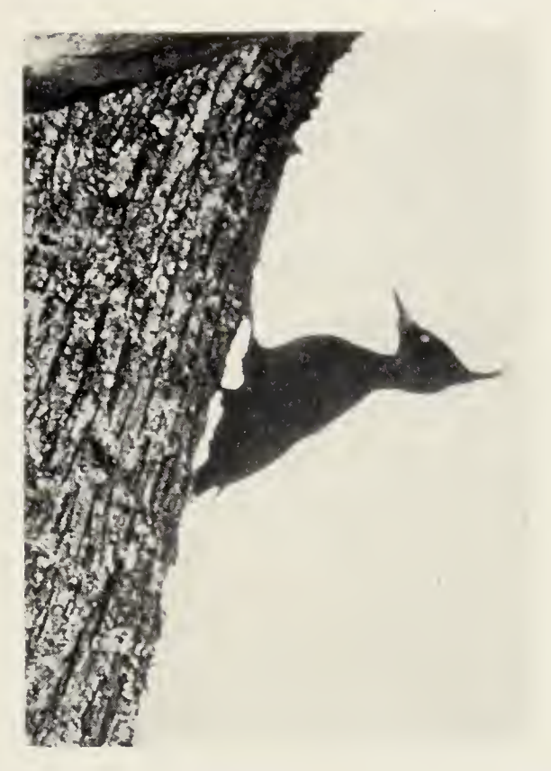
FIG. 3. Same female Magellanic Woodpecker as in Figure 2, shown in silhouette with crest in typical position.

foraged on fallen, rotting logs, and one of these briefly descended to the ground while inspecting the fallen log. It struck me that this species seemed to oecupy a broad "woodpecker niehe," perhaps correlated with the virtual absence of competition. In its diversity of foraging sites it resembled species of Dryocopus (e.g., pileatus , lineatus ) more than other campephiline species.